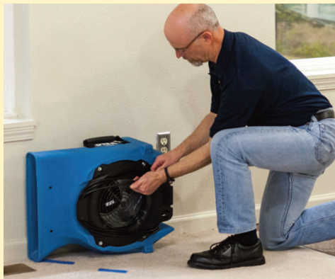
Dri-Eaz Velo™ Airmover in action

Tip: Each Velo includes a GFCI protected power outlet, allowing you to daisy-chain up to six units on a single 15 amp circuit. This lets you maximize "air movement per circuit" – a critical feature in areas where access to power outlets is limited.