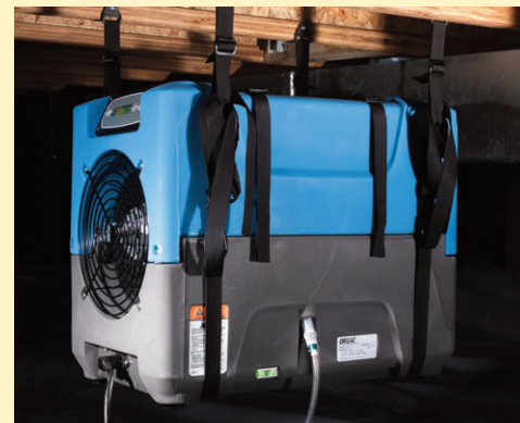
Dri-Eaz Revolution™ LGR Dehumidifier

www.osha.gov/Publications/OSHA-3513roof-snow-hazard.pdf